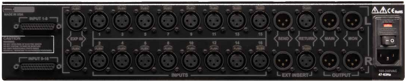
[AC INLET & FUSE HOLDER PICTURED ABOVE]

Feature: Utilizes a standard 3 pin IEC power cable.