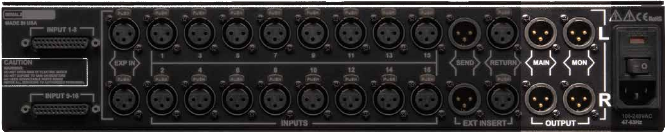
[MAIN & MONITOR CONNECTIONS PICTURED ABOVE]

Feature: Use the MAIN OUTPUT to feed whatever you're using to capture your mix. A pair of interface inputs back into your DAW, an external digital recorder or analog tape machine are typical destinations for final mix prints.