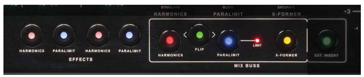
[EFFECTS ASSIGNMENT & ENGAGEMENT CONTROLS PICTURED ABOVE]

Feature: All three color options may be assigned to the mix buss. Harmonics and Paralimit can alternately be assigned to mix stems 13-14 or 15-16 individually or together. When assigned together, the "Flip" button instantly changes the order of Harmonics and Paralimit .