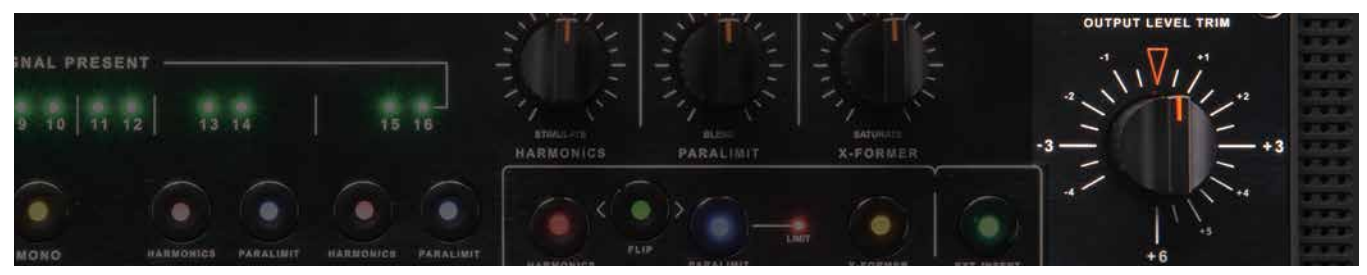
[OUTPUT LEVEL TRIM STEPPED ATTENUATOR PICTURED ABOVE]

Feature: The stepped attenuator (not a potentiometer) can cut -4dB or boost 6dB for the final print stage.